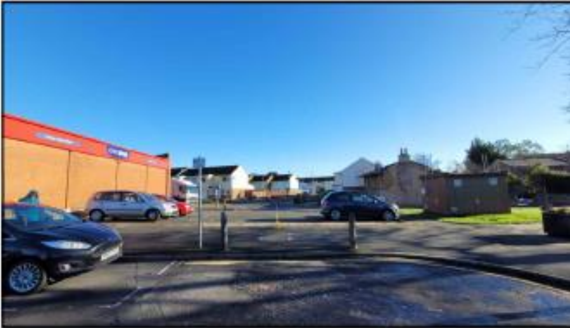
Figure 1 - Site Photograph's

Proposed location of a new mast shown above will assimilate well into the immediate street scene and not be detrimental.